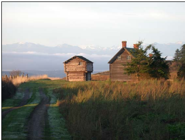
The Jacob Ebey house, built 1855, and Ebey blockhouse, 1856.

This exciting weekend event includes an always-popular raffle and a silent auction at the group dinner on Friday. A symposium on local history and Oregon Trail connections will be held on Saturday, followed by a guided bus tour of Ebey's Landing National Historical Reserve. On Sunday the group will have a continental breakfast and museum tour at the Island County Historical Museum.